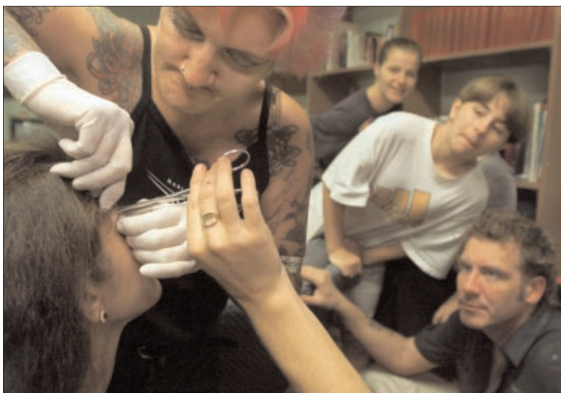
Canon EOS D2000