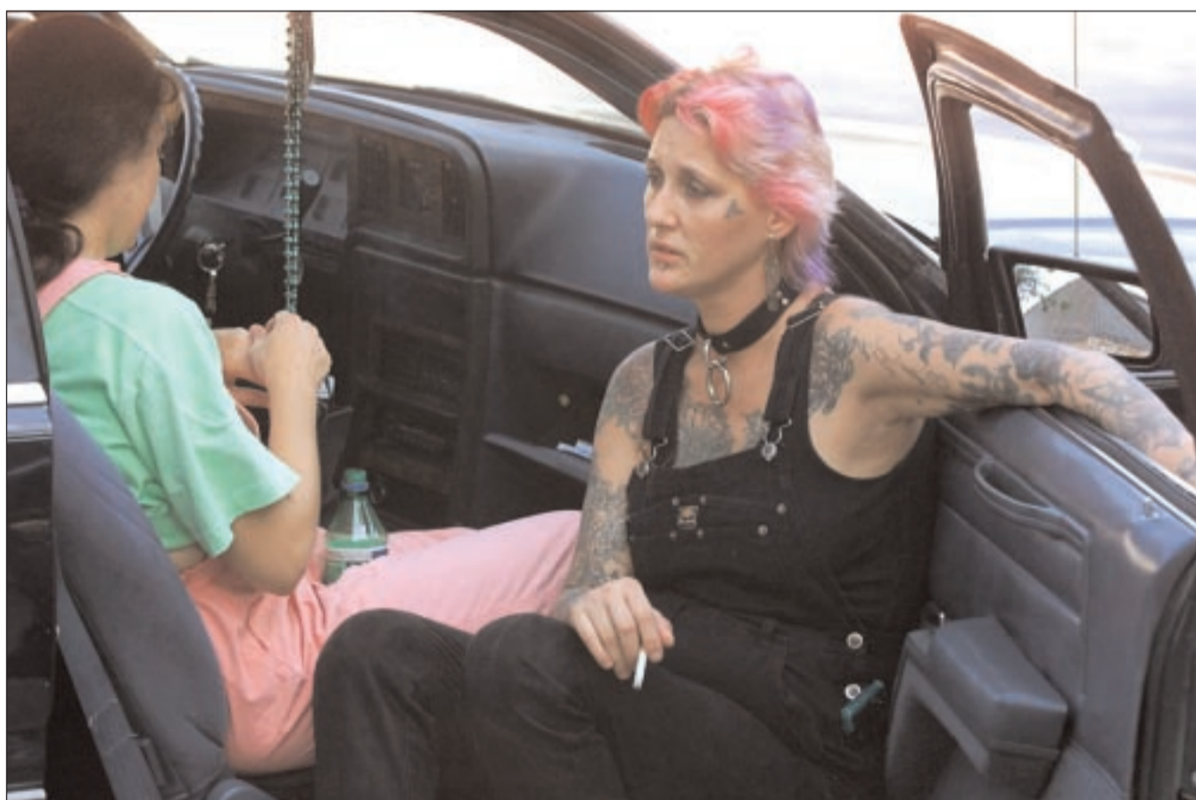
Canon EOS D2000