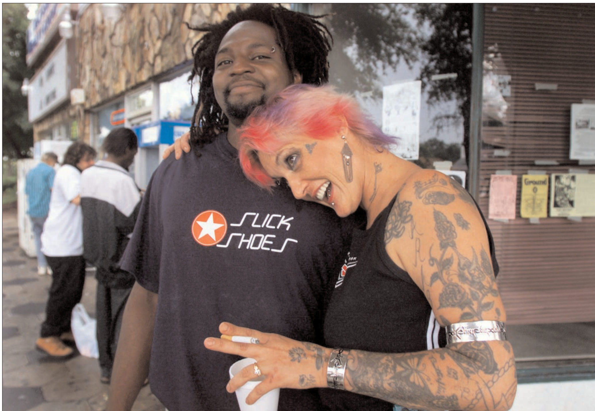
Canon EOS D2000

Struggling to find a direction through community service